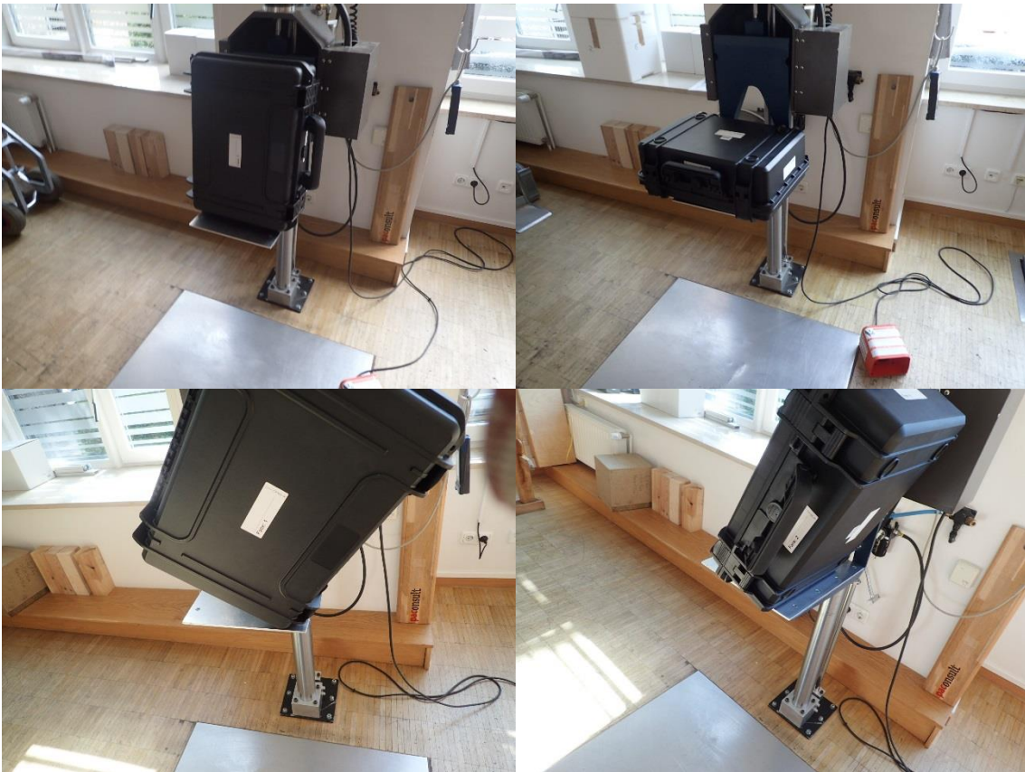
Figure 3: Drop Test – Setups

Figure 3 exemplarily shows the test setups.