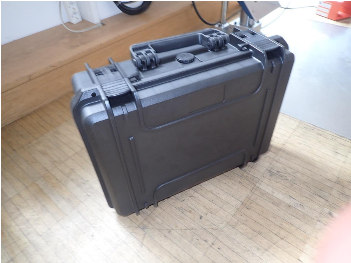
Figure 1: EUT

The incoming goods control showed no visible damages at the specimen.