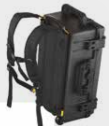
MAXPACK Rucksack-System / Backpack