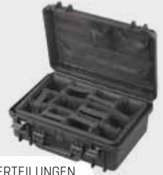
GEPOLSTERTEN UNTERTEILUNGEN PADDED DIVIDERS