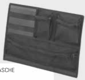
MEHRZWECKTASCHE LID ORGANIZER