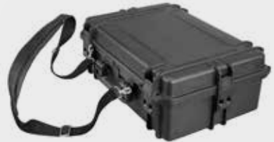
TRAMAX Gepolsterter Tragegurt / Padded shoulder strap