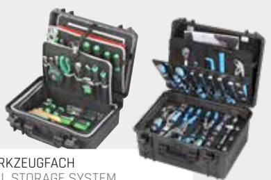
WERKZEUGFACH TOOL STORAGE SYSTEM