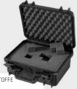
RASTERSCHAUMSTOFFE CUBED FOAMS